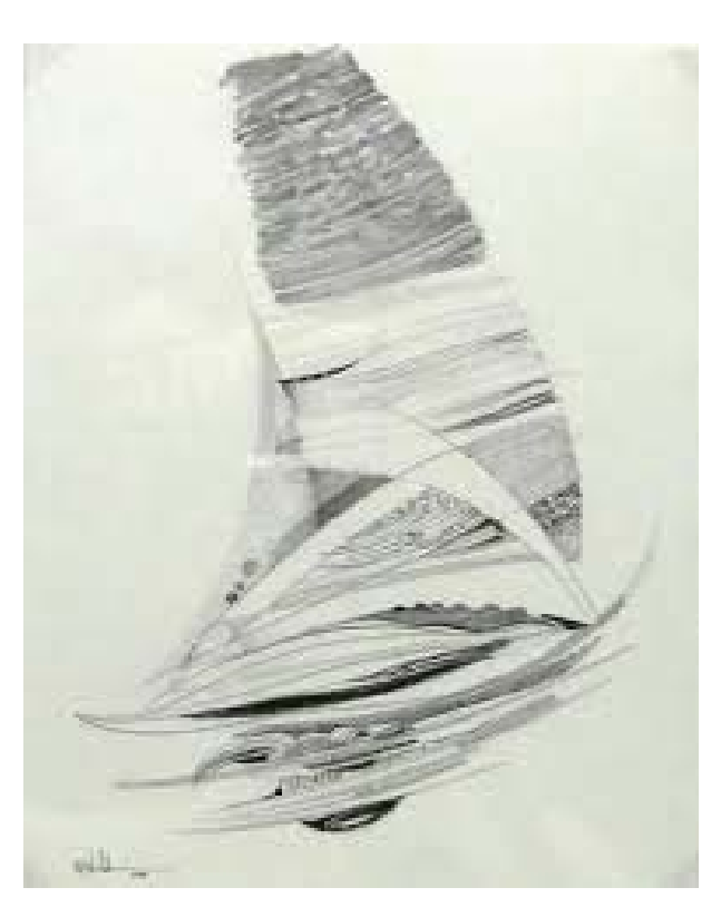
Image of Akataka as a bundle of boundless energy By Renowned Iqbo Artist Obiora Udechukwu xlviii

The Akataka, with its energy and agility, is the most disruptive, "fragmenting" and