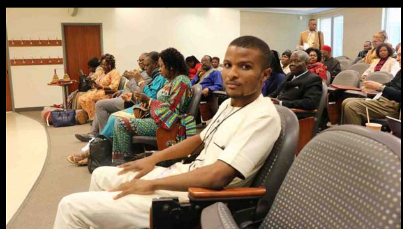
Moments from the 2016 Annual Conference of the Igbo Studies Association Dominican University, Chicago, USA